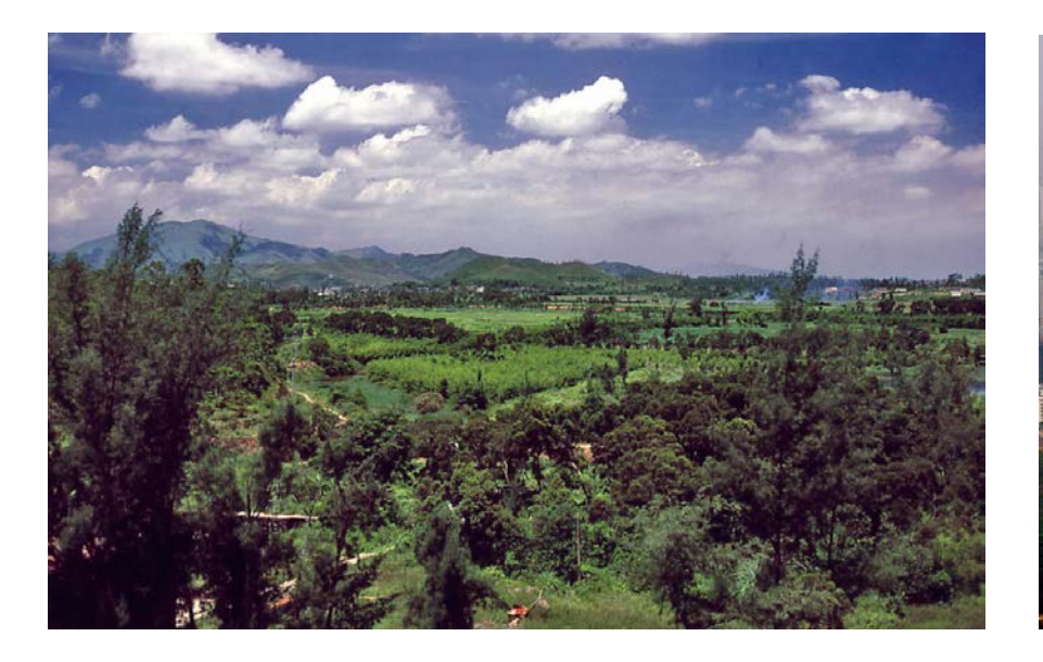
Shenzhen, China, in 1980